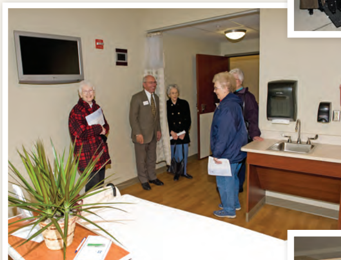
Nearly 2,000 people came to tour Jones Regional Medical Center’s new facility at the open house on October 10. Photos top to bottom show the new physical, occupational and speech therapy department, one of the surgery suites and an inpatient room.