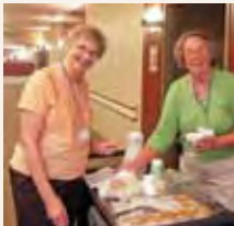
Page 5 Volunteers baking cookies